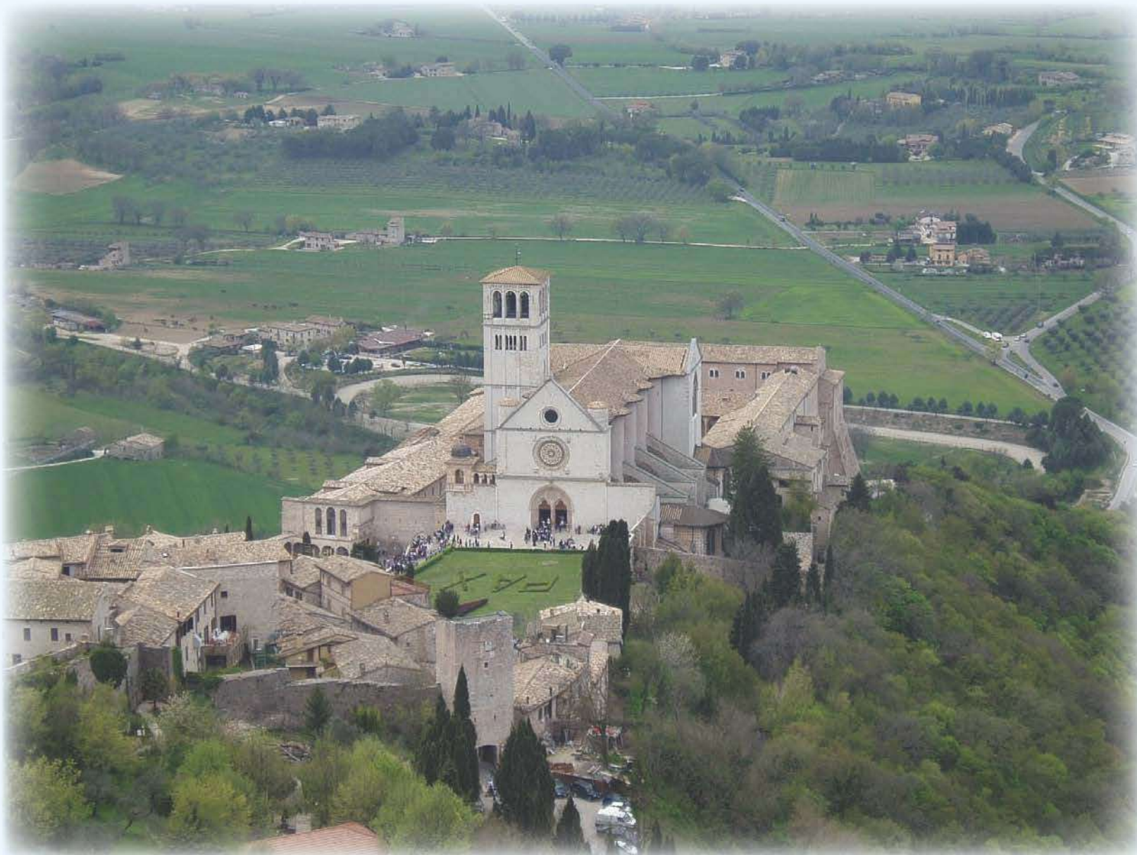
Basilica di San Francesco