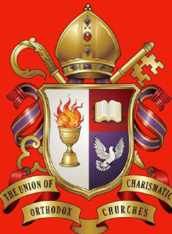
The Union of Charismatic Orthodox Churches