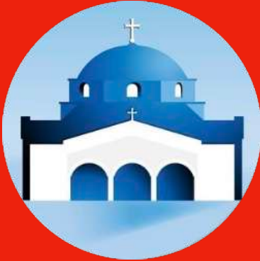
Dormition of the Virgin Mary Greek Orthodox Church, New York